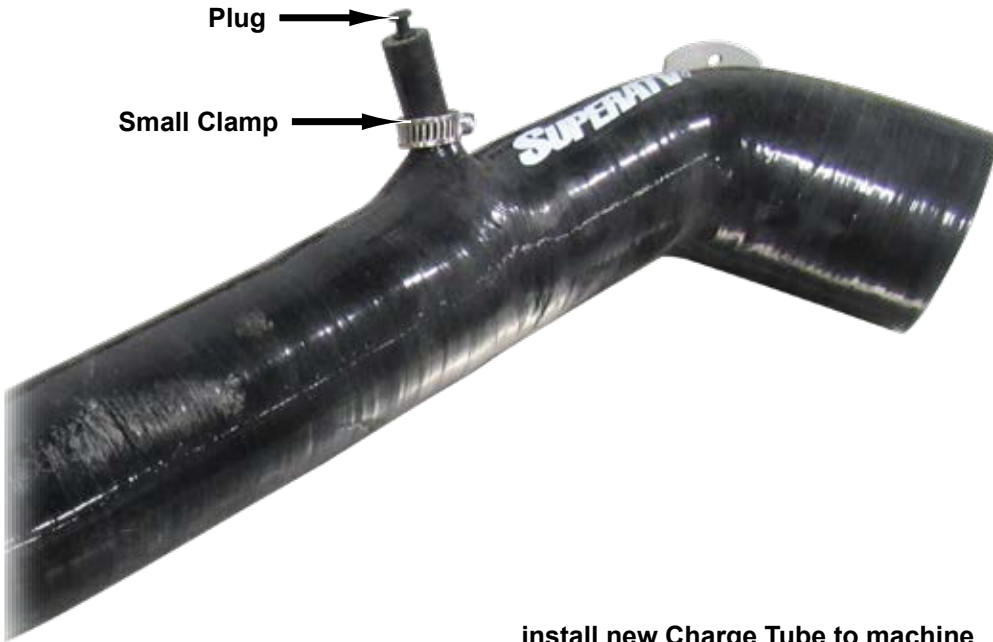
install new Charge Tube to machine