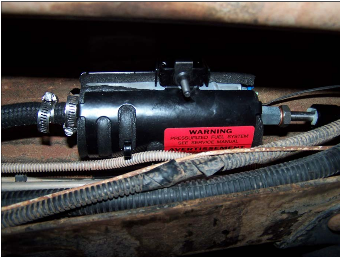
Figure 8 – Hose Double Clamped to Ford Fuel Pump Inlet