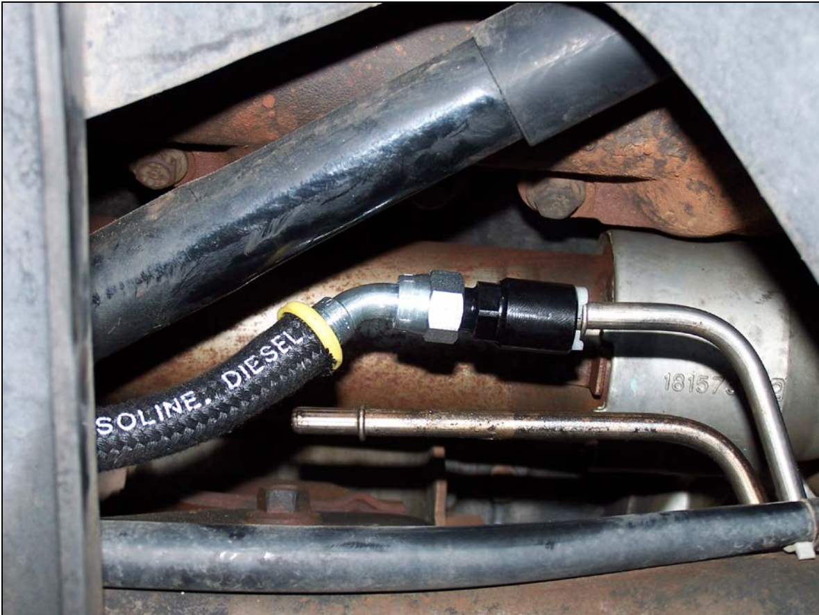
Figure 9 – Return Hose Connection as viewed through Driver Side Fenderwell