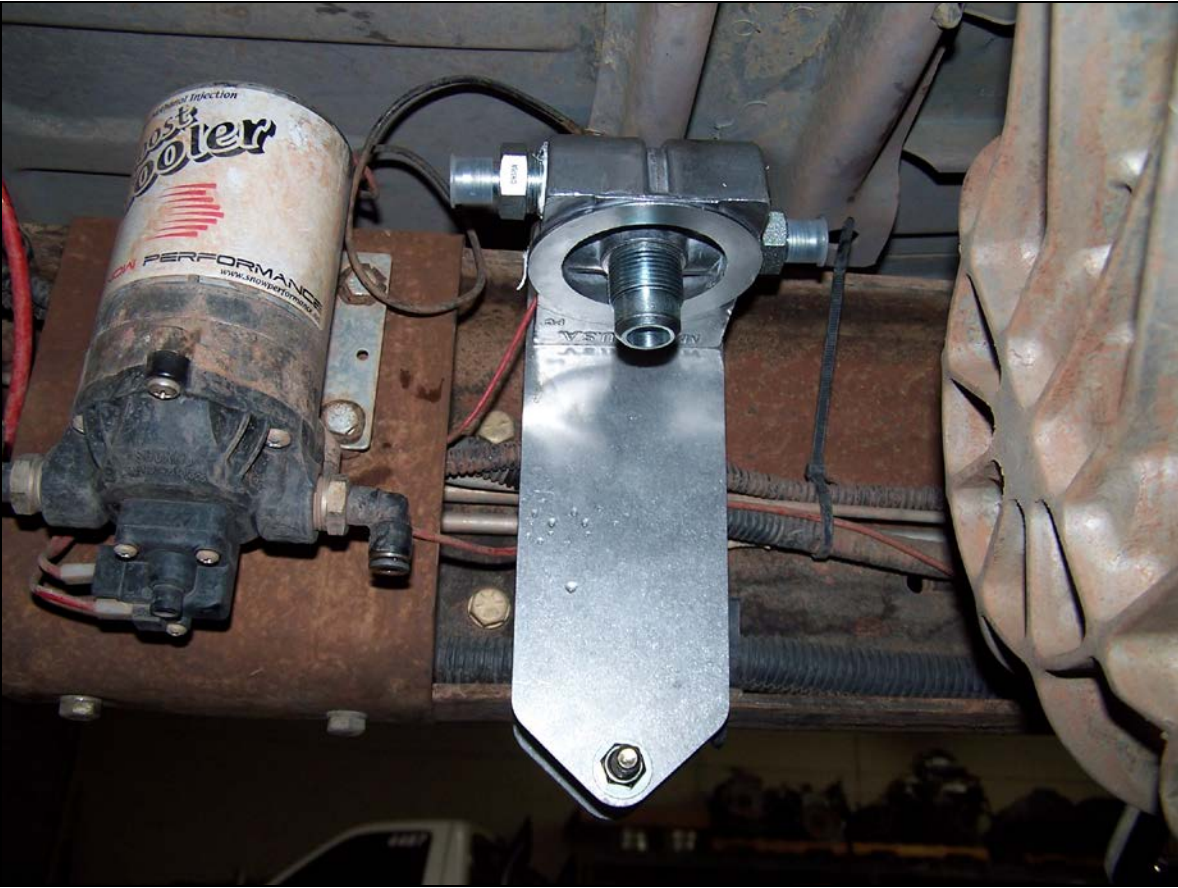
Figure 4 – Fuel Filter Head Mounted on Driven Diesel Filter Bracket