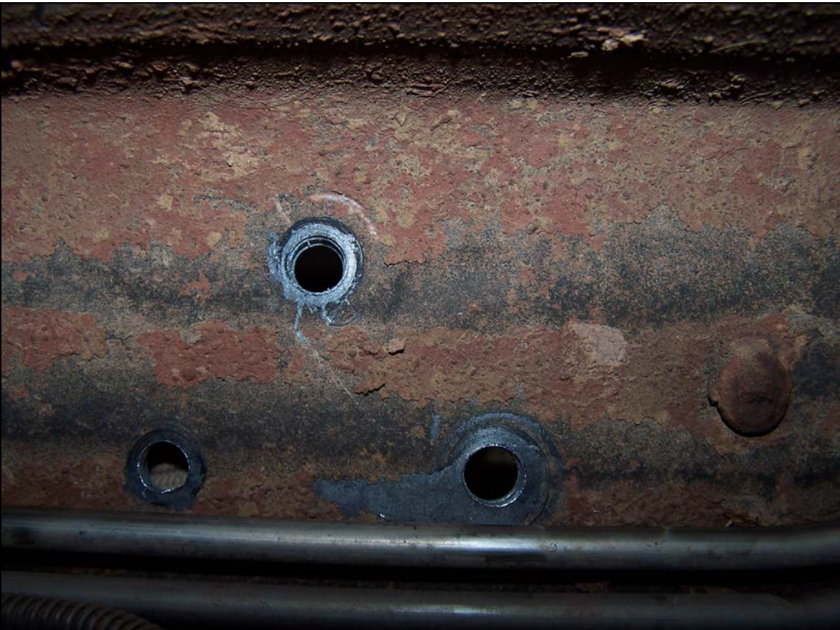
Figure 2 – Auto Trans/4x4 – Additional Holes Drilled for Stock Ford Fuel Pump