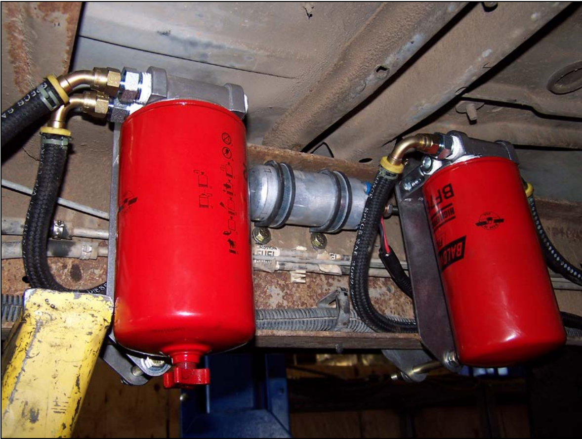
Figure 3 – Stock Fuel Pump – Manual Transmission Installation