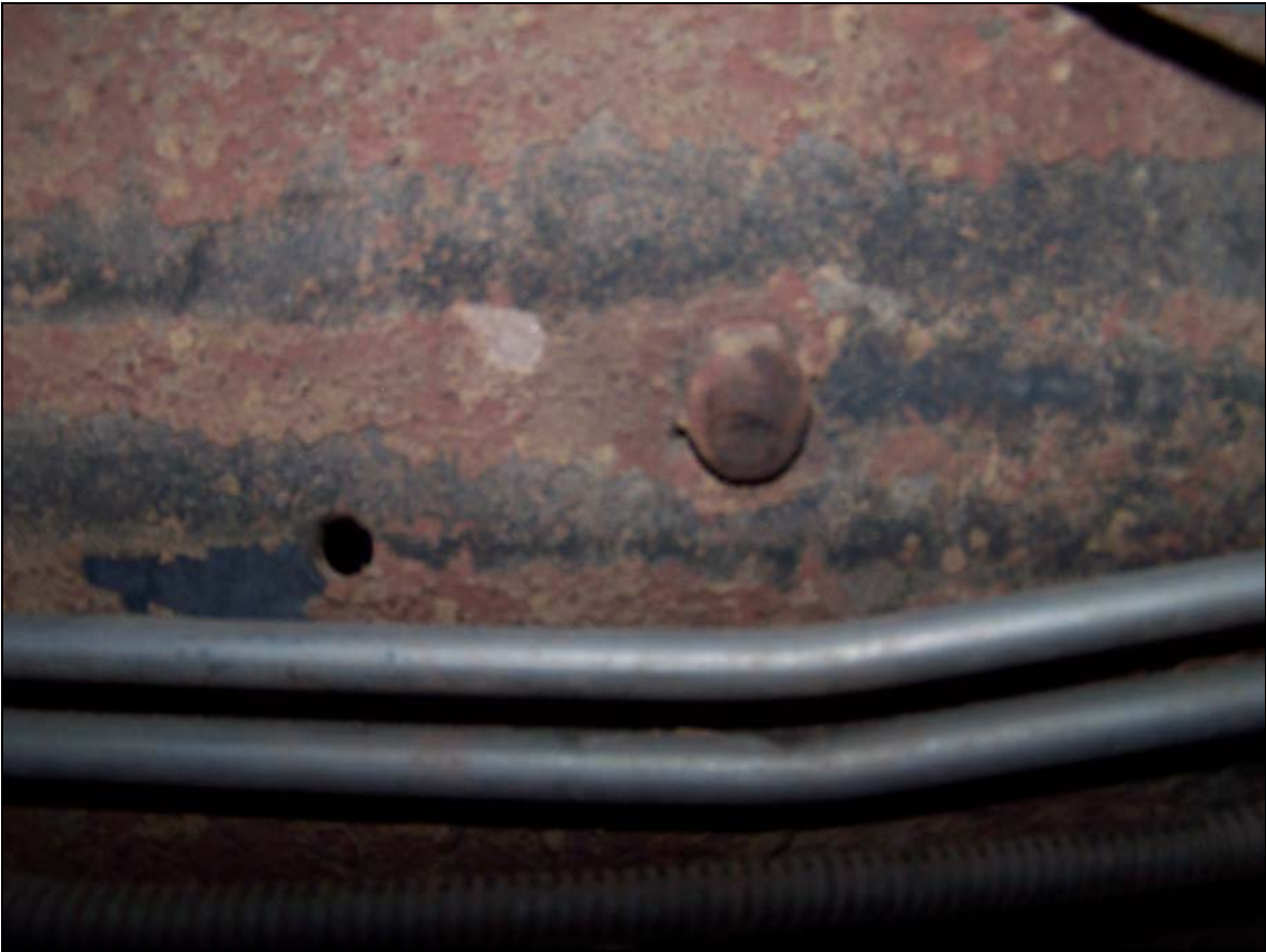
Figure 1 – Auto Trans/4x4 – Existing Hole in Frame