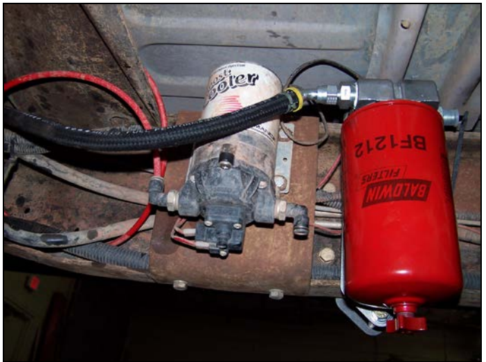
Figures 7a & 7b – Completed Tank Selector to Filter Head Plumbing