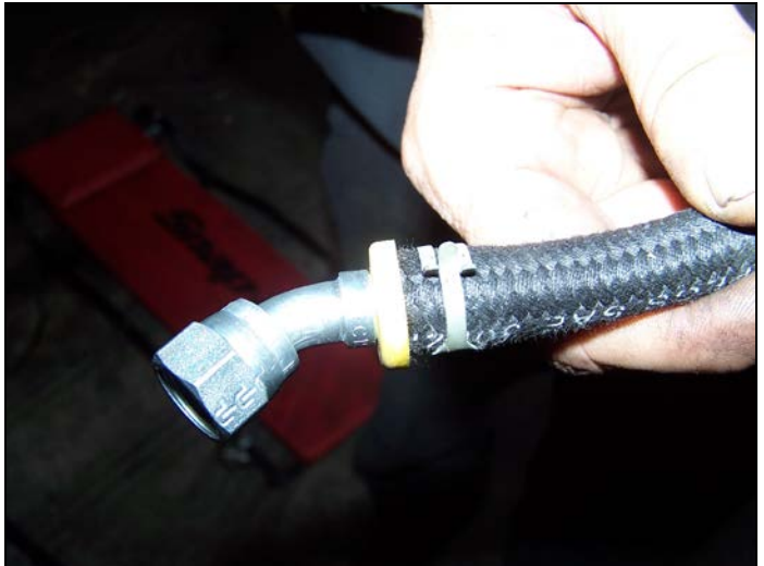
Figures 6a & 6b– Driven Diesel Quick Disconnect Fitting (left) and JIC Fitting (right)