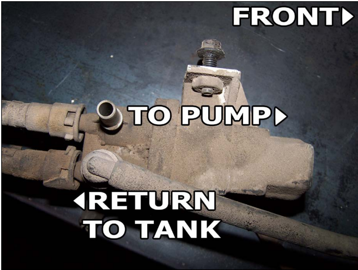
Figure 5 – Fuel Tank Selector Valve – Port Locations and Orientation