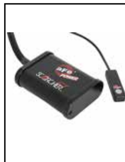
SCORCHER GT Module