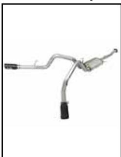
Cat-Back Exhaust System

P/N: 49-43070-B (Blk. Tips) 49-43070-P (Pol. Tips)