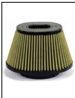
Pro-GUARD 7 Air Filter