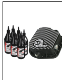
Rear Differential Cover

P/N: 46-70152-WL (w/ Oil) 46-70152 (Blk./Mach.) 46-70150 (RAW)