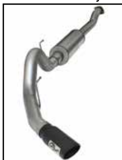
Cat-Back Exhaust System

P/N: 49-43069-B (Blk. Tip) 49-43069-P (Pol. Tip)