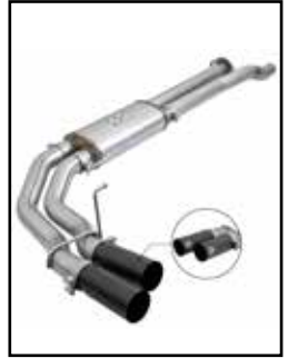
Side-Exit Exhaust System

P/N: 49-43091-B (Blk. Tips) 49-43091-P (Pol. Tips)