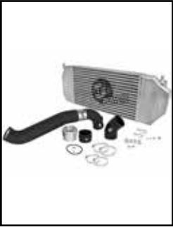
Intercooler w/ Tube