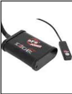
SCORCHER GT Module

P/N: 49-43091-B (Blk. Tips) 49-43091-P (Pol. Tips)