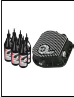
Rear Diff. Cover

P/N: 46-70152-WL (w/ Oil) 46-70152 (Blk, Mch) 46-70150 (RAW)