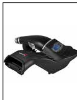
Cold Air Intake System