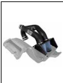
P/N: 51-12642-1B (PDS) 54-12642-1B (P5R)