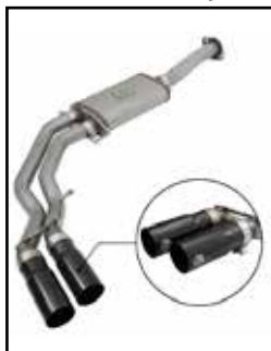
P/N: 49-43081-B (Blk Tips) 49-43081-P (Pol Tips)