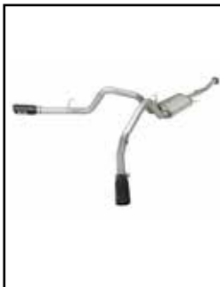
P/N: 49-43070-B (Blk Tips) 49-43070-P (Pol Tips)