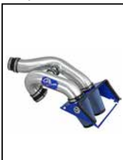
P/N: 52-12642-1H "Limited Edition"