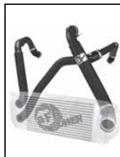
P/N: 46-20214-B (3.5L tt)