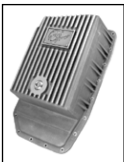
P/N: 46-70170 (RAW) 46-70172 (Blk)