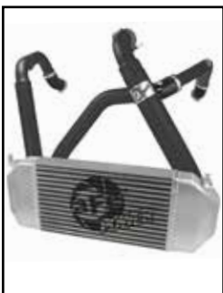
P/N: 46-20212-B (3.5L tt)