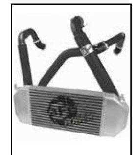
P/N: 46-20212-B (3.5L tt)