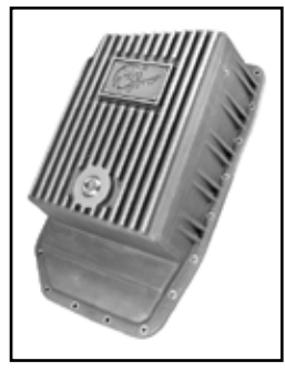
P/N: 46-70170 (RAW) 46-70172 (Blk)