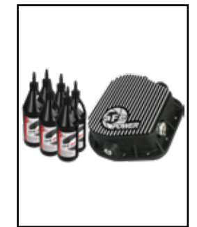
P/N: 46-70152-WL (w/ Oil) 46-70152 (Blk, Mch) 46-70150 (RAW)