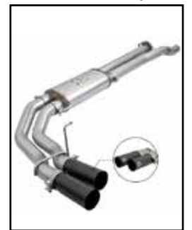
P/N: 49-43091-B (Blk. Tips) 49-43091-P (Pol. Tips)