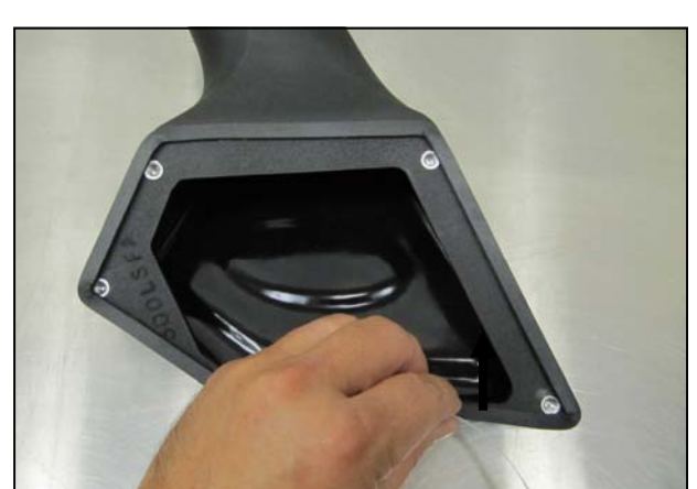
7. Prepare the mating surface of the Fender Adapter (#2) for the Foam Gasket Tape (#10) by cleaning with a prep solvent. Apply the gasket tape along the outside edge of the Fender Adapter as shown, avoiding the bolt