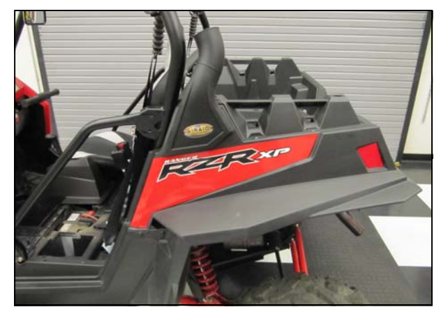
9. Re install the fender onto the vehicle, reusing the nine fasteners from step 2.