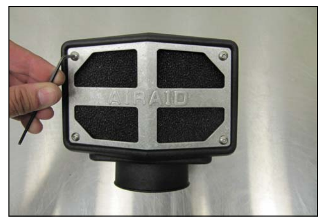
11. Install the Snorkel Screen (#5) onto the Inlet using four 8-32 Button Head Screws (# 13) and a 5/32" Allen wrench