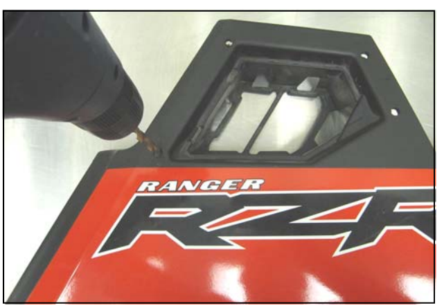
6. Using a 9/32" bit, drill out the pilot holes.