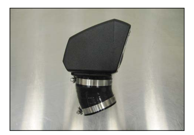
13. Install the Silicone Elbow (#7) and two #48 clamps onto the Inlet a shown. Leave the Hose Clamps loose for now.