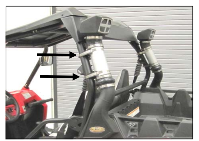
15. Secure the snorkel assemblies to the roll cage using the Tube Mounts (#9) and #68 Clamps (#12). Align the Snorkels to each other for symmetry.