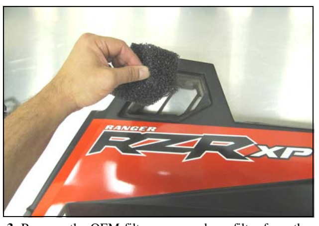
3. Remove the OEM filter cover and pre filter from the fender and set aside. They will not be reused.