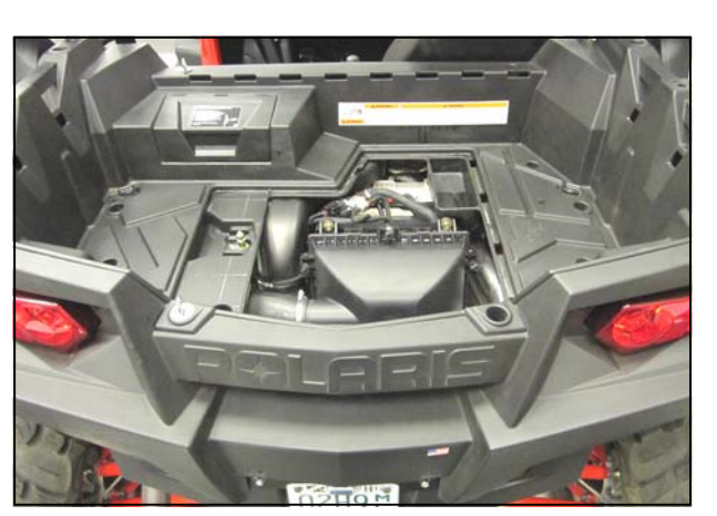
16. Remove the access hatch in the bed and remove the factory air filter from the airbox.