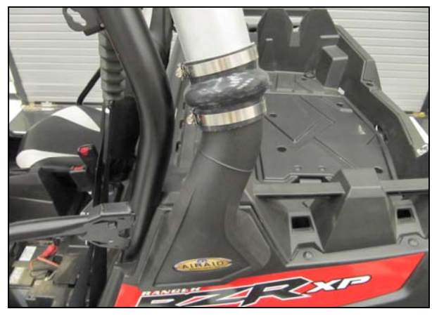
12. Install the Hump Hose (#8) and Aluminum Intake Tube (#3) onto the Fender adapter. Loosely install two #48 Clamps (#8) onto the Hump Hose.