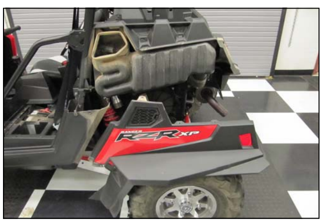
2. Starting on the Drivers side first, remove the nine T-27 head screws holding the fender in place. Remove the fender and place it on a work bench.