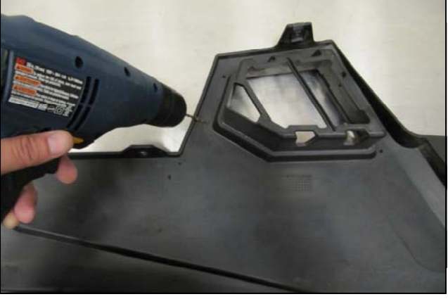
5. Using a drill and a 1/8" bit, drill out the four pilot holes in the inner fender.