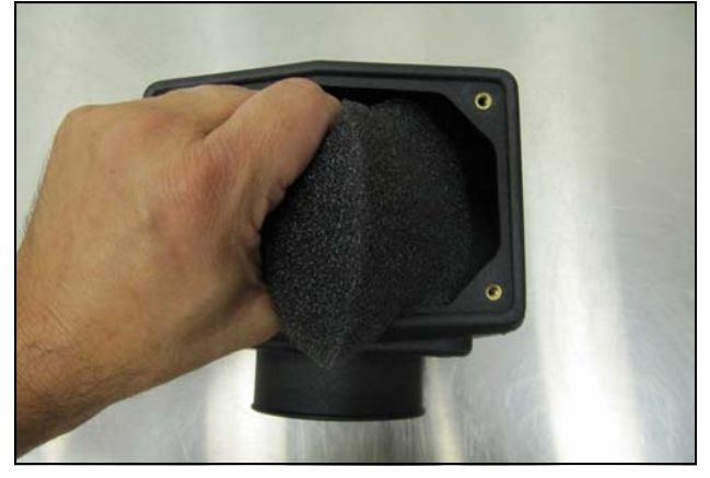
10. Insert the Foam Pre Filter (#6) into the Snorkel Inlet (#4).