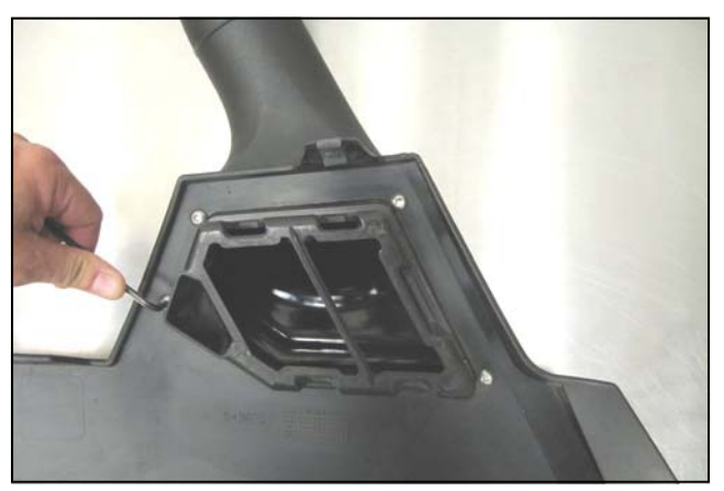
8. Attach the Fender Adapter to the outside of the factory Fender using four 1/4-20 button head screws (#14).