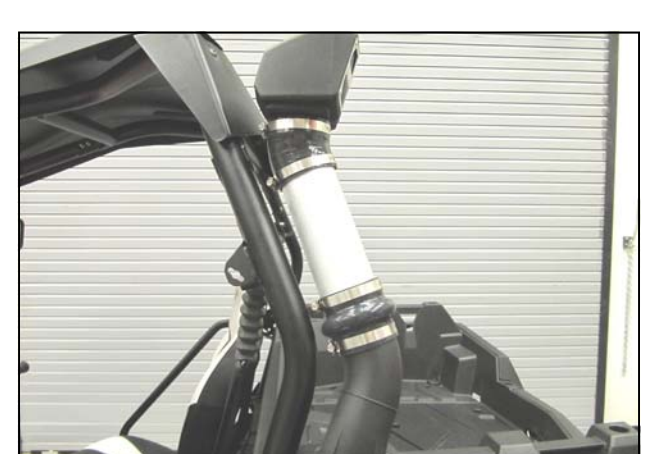
14. Install the Snorkel Inlet and elbow onto the Intake tube. Align the assembly into the desired position and tighten all of the Clamps. Repeat steps 2-14 on the Passenger side and re use the template, face down.