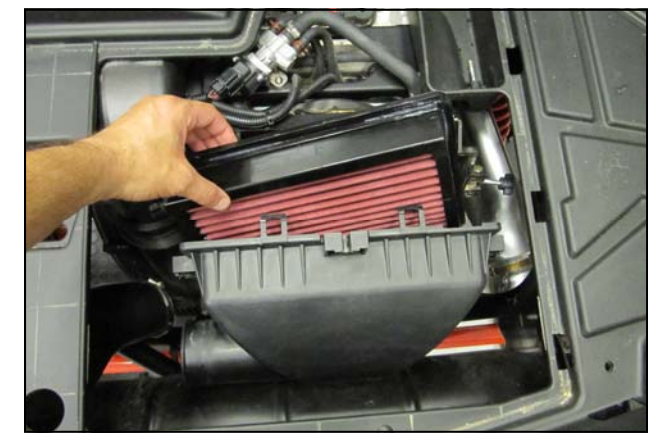
17 . Apply the supplied silicone grease (#15) to both sides of the sealing flange on the Airaid Premium Filter. Install the filter as shown.