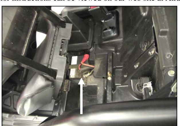
1. Place the range selector in Park and remove the drivers seat from the vehicle. Disconnect the negative terminal on the battery.

Please read these installation instructions in their entirety before beginning the install process. Airaid strongly recommends the use of Locktite® 242 Medium strength threadlocker on all threaded fasteners.