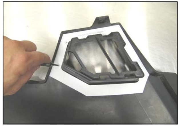
4. Cut out the paper Template. Align it with the edges of inner fender, and punch the four pilot holes. Be careful with the Template as it will be re used on the passenger side fender too.