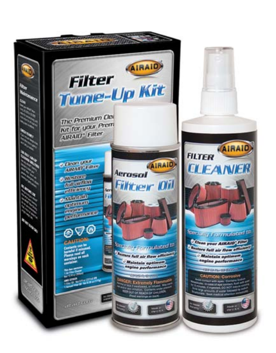
P/N 790-551 Aerosol Spray P/N 790-550 Squeeze Spray